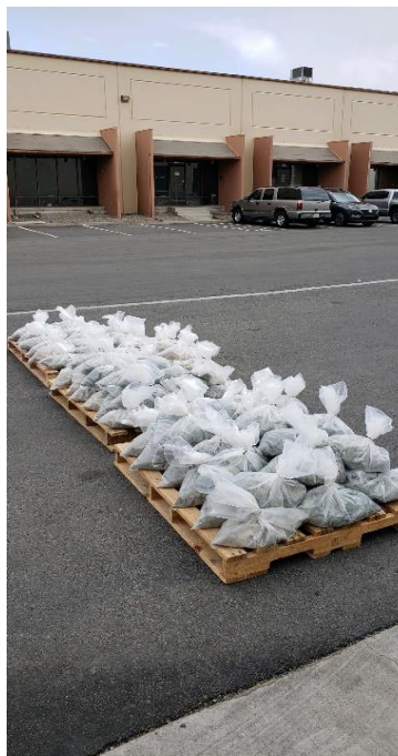
Figure 1 – The last batch of Phase VI drilling samples as they were delivered to ALS in Reno, Nevada.

All 12 of the Phase VI proposed holes were completed to, or beyond, their anticipated depths for a total of 5246 ft (1599 m) of drilling. Most of the holes were drilled with HQ-size core with a diameter of 2.5 inches (63.5 mm). However, 4 of the holes were drilled with PQ-size (3.35 inches, 85 mm diameter) to be used for the ongoing metallurgical test work. The samples from the core have been hand-delivered to ALS Laboratory in Reno, Nevada for processing. QA/QC samples have been inserted into the sample stream to confirm sample results.