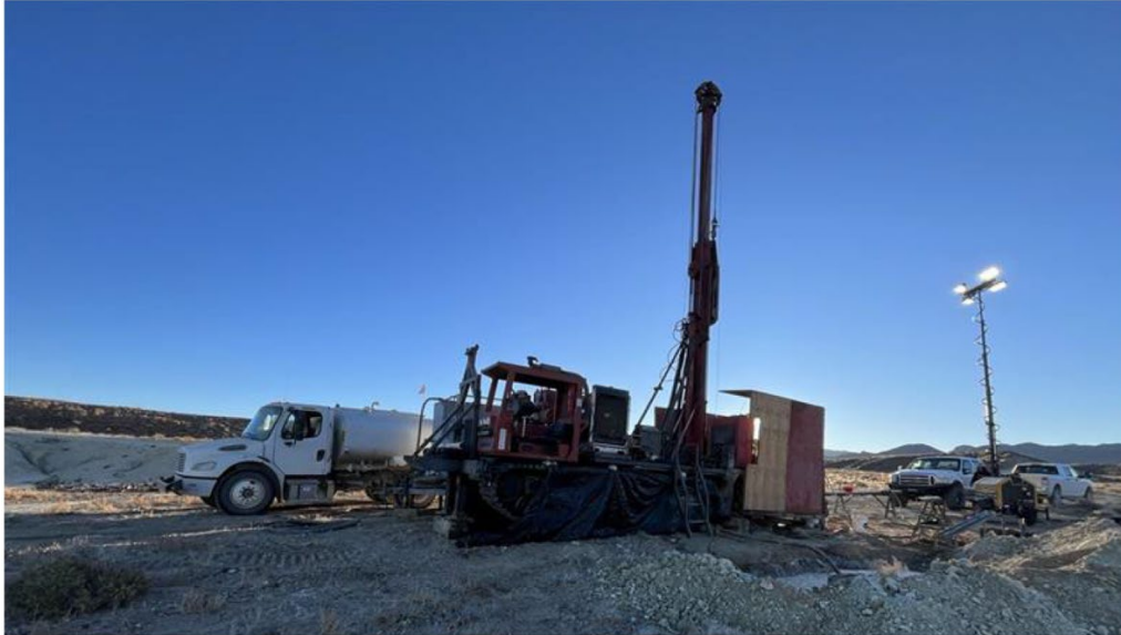
Figure 3 – Titan Drilling’s core rig on CVZ-87.